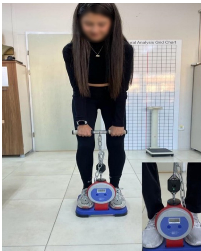
Figure 1. Display of the experimental setup, simultaneously using the Takei and the Powrlink force dynamometers for assessing leg-back muscle strength.

was considered excellent and an ICC with a value between 0.75 and 0.90 was considered good with 95% confidence interval (CI). Correlations between the Takei and Powrlink strength measurements were calculated using Pearson correlation estimates. The reliability of the Powrlink ICCs was estimated along with 95% confidence intervals. In addition, the linear regression coefficient ( r^2 ) was calculated to determine whether variation in the results of the tested instrument (Powrlink) could be explained by variation in the gold standard (isometric leg dynamometer). The standard error of measurement (SEM) and minimum detectable change (MDC) with 95% confidence interval was calculated by dividing the SD of the mean differences between the 2 measurements by the square root of 2 ( SEM = SD \times \sqrt{1 - ICC} ). SEM % was defined as (SEM / X) \times 100 , where X is the mean for all observations from test sessions 1 and 2. MDC was calculated using the following formula MDC = Z \times SEM \times \sqrt{2} , where z = 1.96 (based on 95% confidence), indicating the smallest observable change that is real and not due to measurement error in the measurement. To calculate MDC independent of the units of measurement, MDC% was defined as (MDC / X) \times 100 . A smaller MDC indicates a more sensitive measurement.